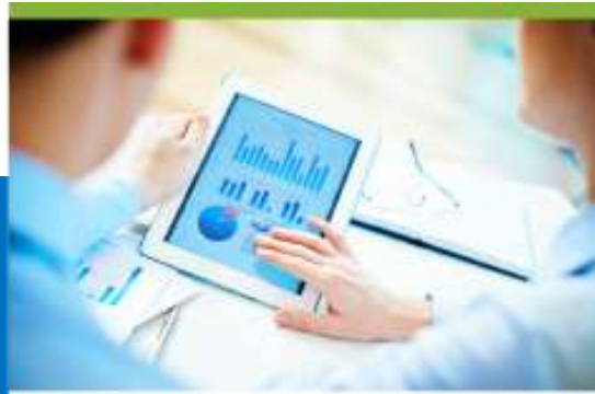
SCIENCE AND TECHNOLOGY